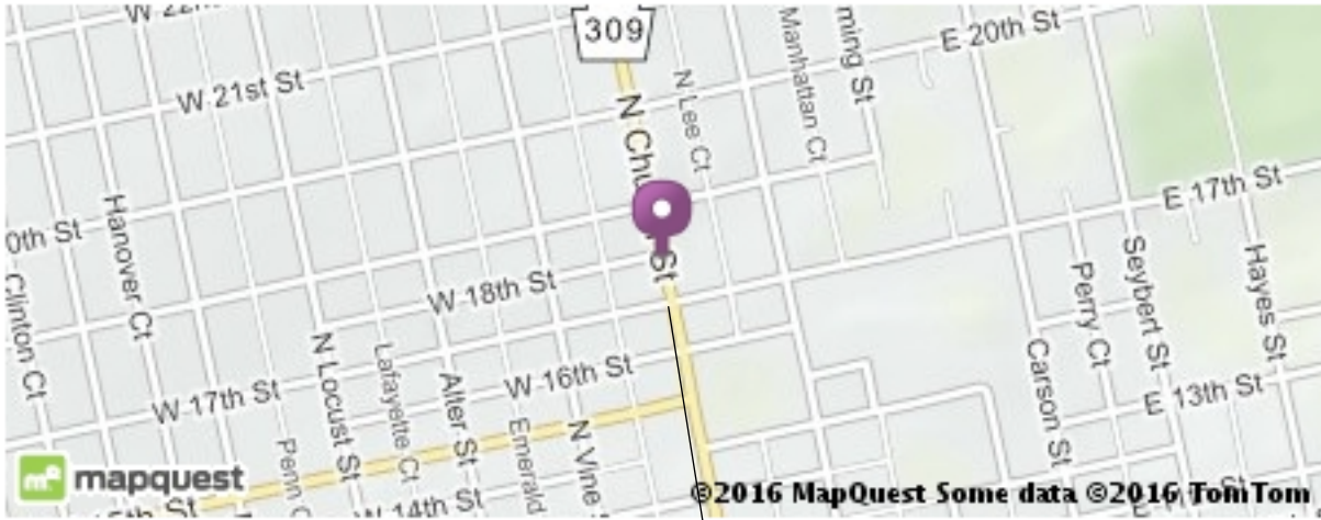
Map of Hazleton, PA